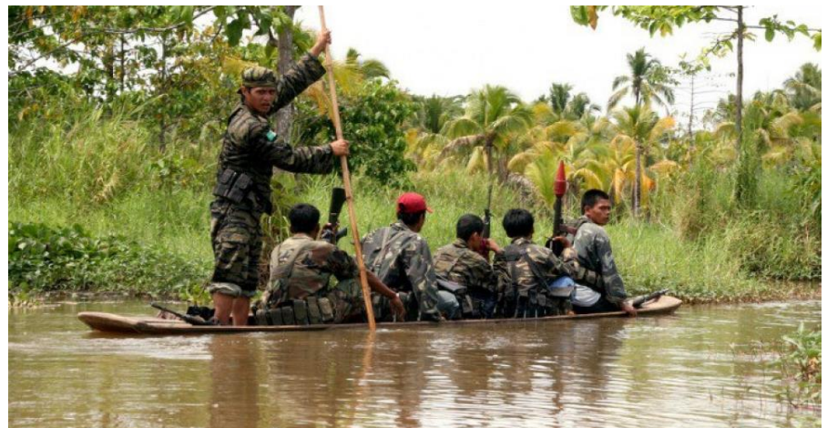
Moro Islamic Liberation Front fighters in 2008.

E arly in the morning of January 25, commandos belonging to the Special Action Force of the Philippine National Police crept into the southern town of Mamasapano — a stronghold of the separatist Moro Islamic Liberation Front. The elite Seaborne Unit had come for Zulkifli Abdhir, a Malaysian bomb maker better known as “Marwan.”